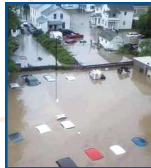
Flooding in Herkimer, NY on June 2013.