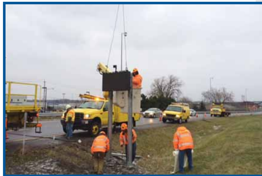
New York State Thruway employees install a Wrong Way Deterrent Sign system at the Thruway's Buffalo exit in December 2013. Commenting on the installation in Buffalo, Governor Andrew Cuomo said, "New York is the first state in the nation to utilize this sophisticated technology to enhance traffic safety and save lives."

Since acquiring Advanced Technologies in June 2011, sales in 2013 reached the highest level in the safety company's history. Records sales were achieved with both the retail store in Herkimer, NY and an e-commerce site: www.advancedtechsafety.com . Advanced Tech is a division of the Herkimer ARC and is a supplier of safety equipment to fire, rescue, EMS, law enforcement, commercial, and industrial customers with a storefront at 246 N. Main St., Herkimer. Workers at Herkimer Industries assist the store with both sewing and packaging support. Proceeds from sales help to support services for people with disabilities.