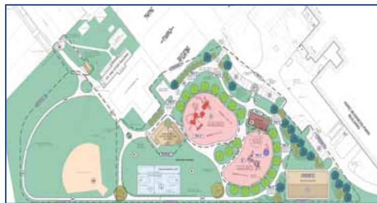
A rendering of the HARC Community Park. The vision of the Park is to enrich lives throughout the region by bringing together people of all ages and abilities for a unique recreational, wellness, and social experience that fosters community for all.