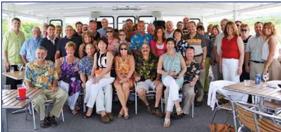
Circle of Friends Erie Canal Cruise Social - June 2014.

Supporters Change Lives. The Herkimer ARC sponsors a Membership Drive each year, which attracted 1,376 members in 2014. Businesses, families, and individuals support the mission and help to advocate for individuals with disabilities and their families with local, state, and national representatives and organizations.