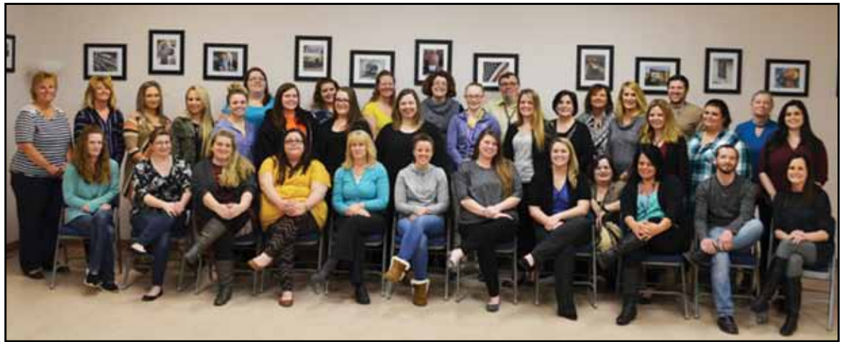
Arc Herkimer Supports & Services Management Team meets regularly to share best practices.