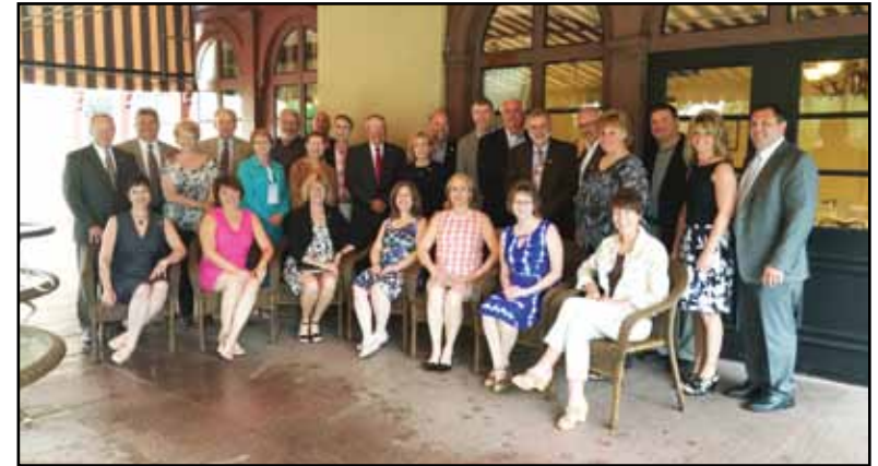
In June, Circle of Friends members enjoyed brunch at Fountain Elms Terrace Café at Munson-Williams-Proctor Arts Institute and then joined a docent-guided tour of the Museum of Art and the photography exhibit, Seneca Ray Stoddard: Capturing the Adirondacks.