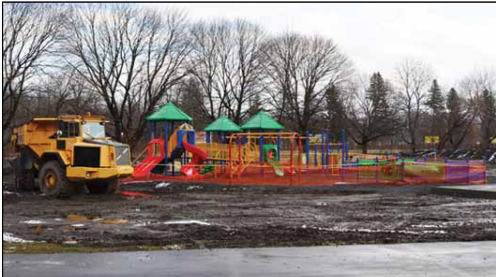
Contractors started building the playground equipment in Fall 2016. When completed there will be three play areas for ages to 24 months; ages 2 to 5; and ages 5 to 12 with age-appropriate equipment.

◀ A PARK FOR EVERYONE — The Mohawk Valley Region Accessible Park project, located behind the Arc Herkimer Business Park in Herkimer, NY, is a unique regional asset that will be used by people of all abilities from local areas and surrounding counties. The young, elderly, those with disabilities, and families—no one will be limited in enjoying recreation. The park will feature play areas for specific age groups, a bandstand, fitness trail and stations, basketball court, softball field, family pavilion, concession stand, and more. Adaptive equipment such as basketball hoops that can lower and special field surfaces will accommodate individuals in wheelchairs and those with other needs.