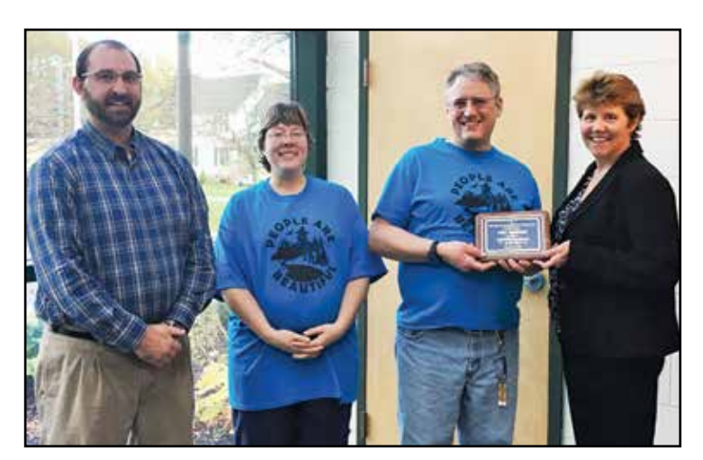
Arc Herkimer Named SANYS Agency of the Year

• Arc Herkimer was honored for its commitment to the self-advocacy movement for over 25 years, along with the support of self-advocates. Initiatives recognized include fundraising efforts and creating the Arc Herkimer Business Park, which provides jobs for people with disabilities, and opening Arc Park, a place where people of all abilities can enjoy exercise and recreation.