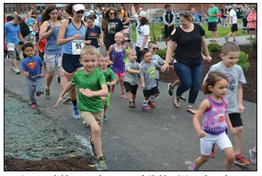
Over 50 children ran the inaugural Children's Run throughout Arc Park. The day also included the annual Heart and Sole 5K run, with new route, and a Walk In My Shoes Awareness Walk.

▶ Partners in Recreation — Arc Park committee members and special guests joined together for an official ribbon cutting and park opening ceremony. The partnerships Arc Herkimer created through building the Arc Park project have been amazing. The park is not only fun, but it's helping to improve the health of those who visit from a nine-county region.