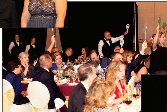
▶ Paddles start to fly into the air during the Fund-A-Need portion of NYIWA. This year's cause was safety and security.