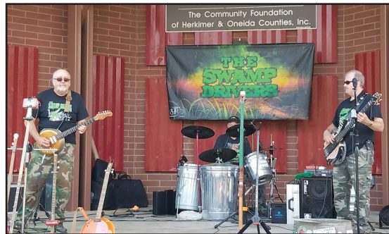
The Swamp Drivers play music for a large crowd during the summer concert series.